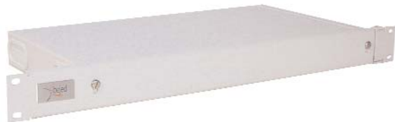
closed front view

The BJ-1833 is designed for a variety of uses. It will accommodate splitters for Cable TV applications and can be used for 12 couplers and/or splices.